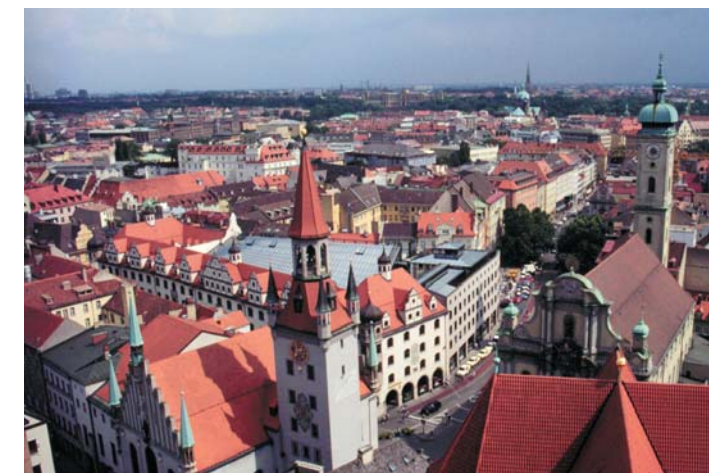
More inspiring places, clockwise: > The rooftops of Munich glow on a clear summer morning. >> Banana trees have appeal on Rarotonga, Cook Islands in the South Pacific. >>> A Sunday night market lights up a neighborhood in Kuala Lampur, Malaysia. >>>> Kyia samples, and then buys, some zesty red pesto from this merchant in Palermo, Sicily.